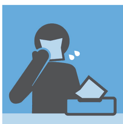
COVER YOUR MOUTH WITH A TISSUE OR SLEEVE WHEN COUGHING OR SNEEZING