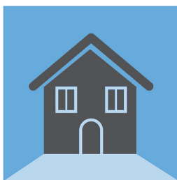
STAY HOME WHEN YOU ARE SICK

COVID-19 Information for Businesses: ( https://www.tpchd.org/healthy-people/diseases/covid-19-information-for-businesses )