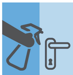
CLEAN AND DISINFECT "HIGH-TOUCH" SURFACES OFTEN