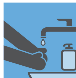
WASH HANDS OFTEN WITH WATER AND SOAP (20 SECONDS OR LONGER)