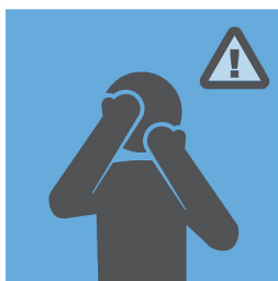
AVOID TOUCHING YOUR EYES, NOSE, OR MOUTH WITH UNWASHED HANDS OR AFTER TOUCHING SURFACES