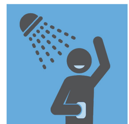
PRACTICE GOOD HYGIENE HABITS

For more information, visit: coronavirus.ohio.gov